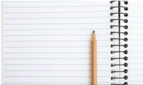
2022 Program Details