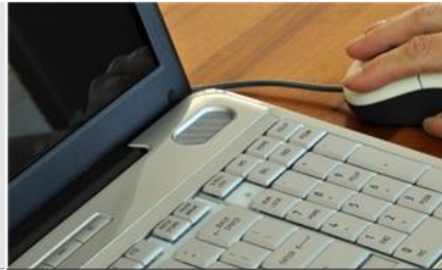
Personal Health Survey